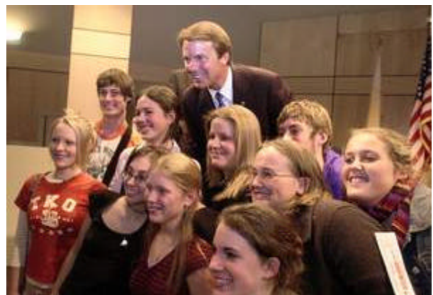
ZOOM Former U.S. Sen. John Edwards with Northern Kentucky area high school students who attended his debate Tuesday with two-time presidential candidate Steve Forbes, part of the NKU Alumni Lecture Series.

"Have each of them do their own taxes without the help of software. Then we'd get results," he said.